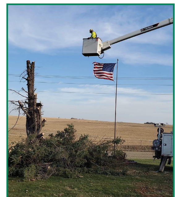
Franklin REC's line crew works on tree trimming.

Did you know trimming within 10 feet (in any direction) of a power line is illegal? Only