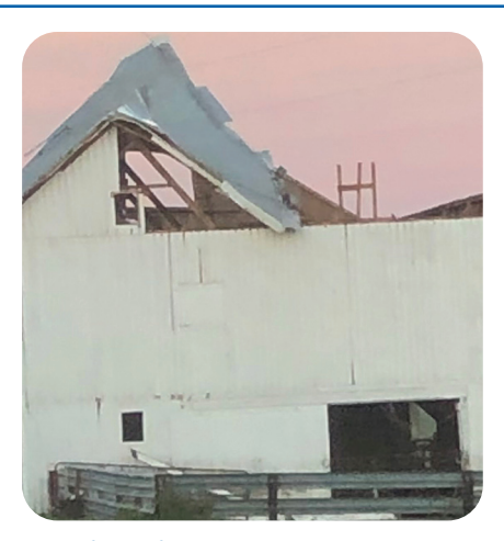
A roof torn from a barn on Maquoketa Valley REC lines.