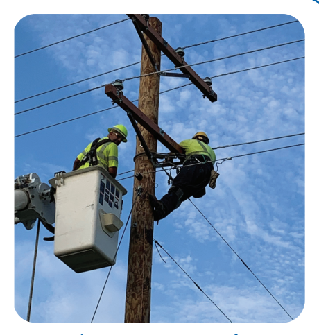
Line workers restoring power for Maquoketa Valley REC members.