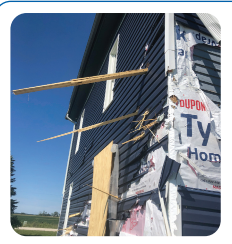
The room was occupied in this home on Linn County REC lines when the 2x4s flew into the house.