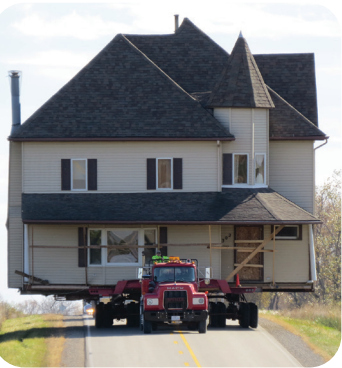
In October, Franklin REC line crews were involved in the move of a house from Swaledale onto a property on Franklin REC lines.