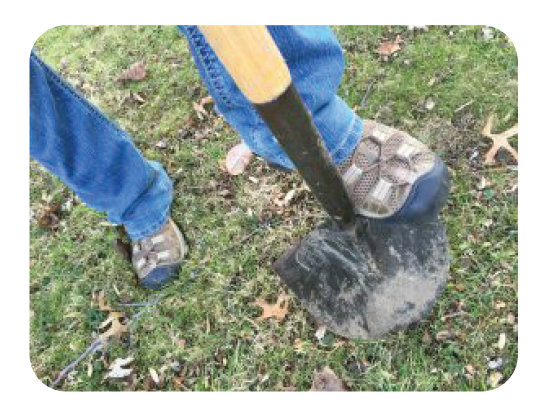
ALWAYS call Iowa One Call at 8-1-1 for utility locates at least 48 hours before digging. It's the law.

To the south of your home, plant tall trees to provide shade. If you plant these trees far