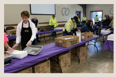
Franklin REC employees, directors, and the Franklin County Development Association director assemble meals during the drivethru event.